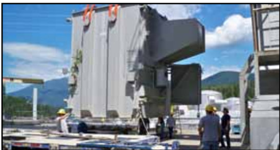
Photos: left, new step up transformers are unloaded at Noxon Rapids Dam. Below, Replacement transformers on the deck at Noxon Rapids Dam.